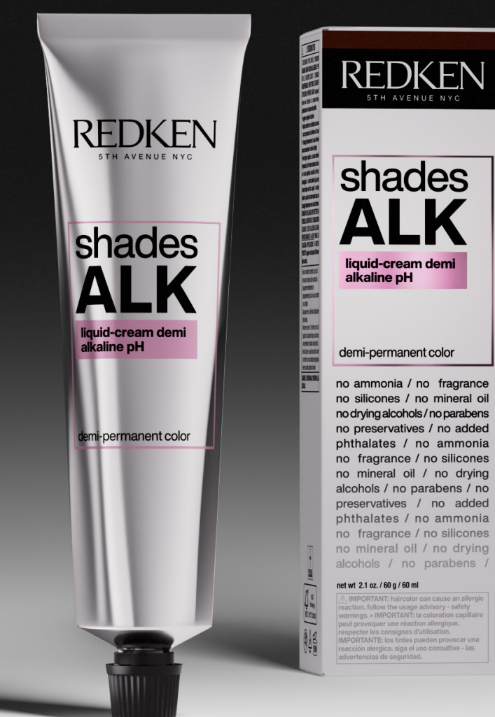
*Superior Gray Coverage Family